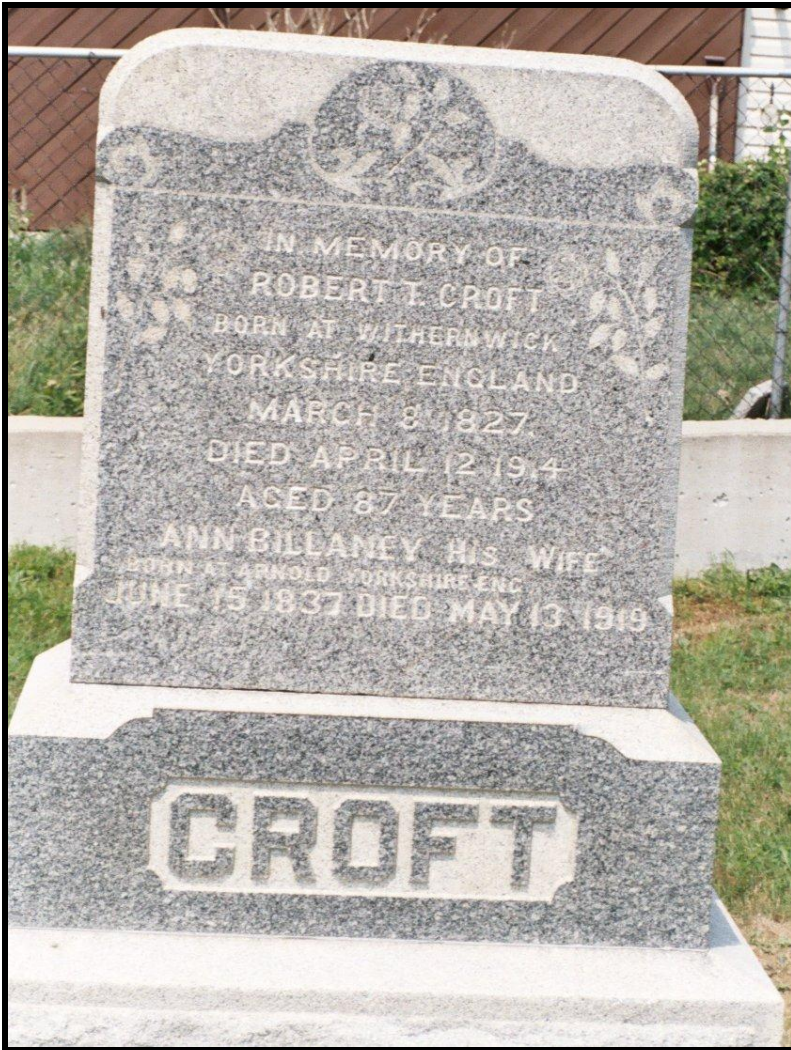
Figure 2: Gravesite of Robert Taylor Croft in the town of Essex, Essex County, Ontario, Canada.