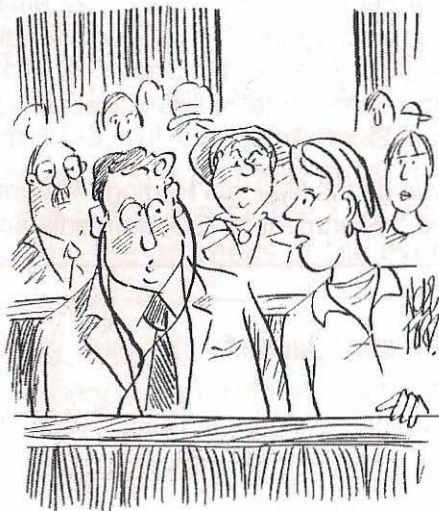
"Standing up for the National Anthem in the middle of the sermon was a bit of a giveaway that you were watching the Olympics on your iPhone!"